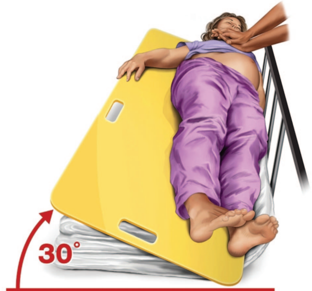
Figure 4. Patient in a 30° left-lateral tilt using a firm wedge to support pelvis and thorax.

of the diaphragm and abdominal contents caused by the gravid uterus.