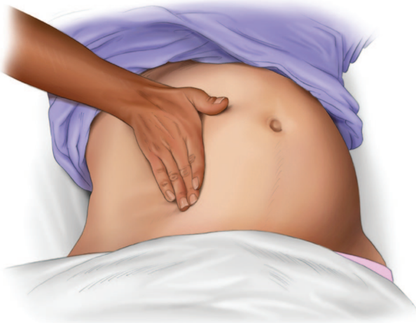
Figure 3. Left uterine displacement using 1-handed technique.

Chest compressions should be performed slightly higher on the sternum than normally recommended to adjust for the elevation